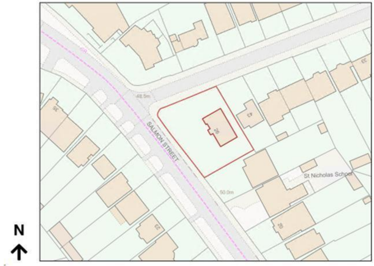
This map is indicative only.